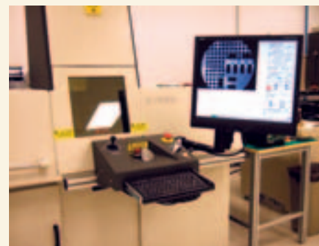
Our programmable X-Ray inspection system displays solder joints at 400x magnification, enabling detection of hard-to-find solder defects.