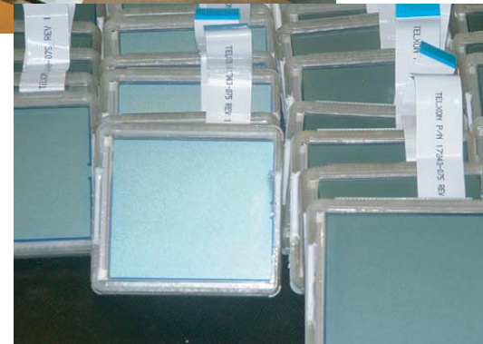
Highly skilled technicians use manufacturing-grade equipment to repair the most popular LCD panels.

Obtain flexible, customized service via “depot” service. HVT offers a full range of display service capabilities, with the ability to cover all of your in-warranty, out-of-warranty, and end-of-life repair needs. Customers receive cost-saving benefits of our engineering excellence, economies of scale, parts inventory and supply chain management. We customize our service to meet the exact specification of each customer, from receiving through testing, repair, cosmetics, labeling and shipping. As a service partner, HVT can link to your call center and other third-party suppliers, providing seamless integration to existing service departments.